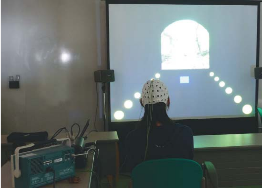
Figure 3. Monitoring drivers' alertness level in a virtual reality driving simulation using BCI and P300 signals.

The study revealed that the driver's alertness declined throughout the experiment as the P300 amplitude decreased. This occurred because the drivers received constant feedback. By actively changing the source of audio stimuli, depending on the current P300, the system kept the user alert by keeping the P300's amplitude high, thus preventing the user from falling asleep. This auditory BCI system actively monitored the cognitive state of the drivers and warned them during drops in alertness.