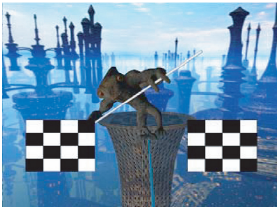
Figure 1. The MindBalance videogame. The player must control the balance of a virtual character walking a tightrope by applying visual attention to two flickering checkerboards.

Researchers at University College Dublin and MediaLabEurope have created MindBalance [5], a videogame that uses BCI to interact with virtual worlds. As Figure 1 shows, the game involves moving an animated 3D character within a virtual environment. The objective is to gain one-dimensional control of the character's balance on a tightrope using only the player's EEG. The developed BCI uses the SSVEP generated in response to phase-reversing checkerboard patterns. The SSVEP simplifies the signal-processing methods dramatically so that users require little or no training.