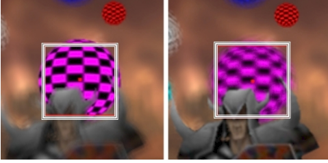
Figure 1: Depth-of-Field Blur when using a focus area (white square), without (left) and with (right) semantic weighting.

An optimal way to determine in real-time the focal distance would be to use an eye-tracking system. However, such devices are still expensive, complex and not available on a mass market. Thus, in absence of an eye-tracking system, we propose to use a paradigm used in First-Person-Shooter games (FPS). In FPS games, the user manipulates with his/her 2D mouse and keyboard a virtual visor always located at the centre of the screen. In this case, we can assume that the user mainly looks at the part of the screen close to the visor. Actually, using an eye-tracking system, Kenny et al. [2005] found that gamers of FPS videogames watched indeed more than 82% of the time the central area of the monitor. Then, we introduce the notion of "focus area", i.e., a square area located at the centre of the screen that the user is supposed to preferentially look at. This focus area recalls auto-focus systems used in digital camera which also aim at providing an appropriate focal distance when taking a picture (see Figure 1).