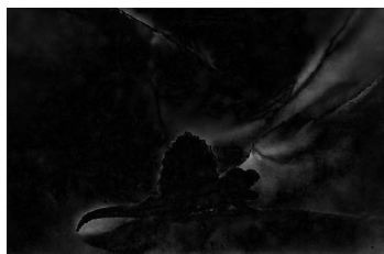
Barron Angular Error: 3.30^\circ