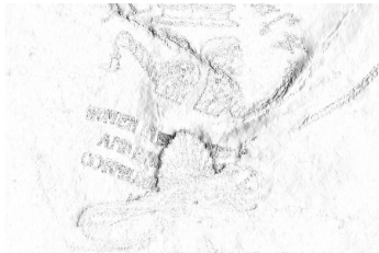
Prior robust weights \hat{z}_r (horizontal cliques)