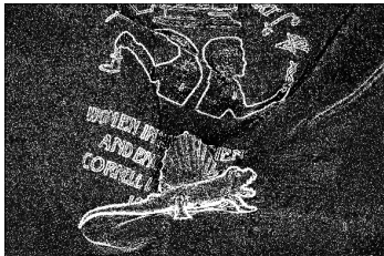
Likelihood robust weights \hat{z}_d